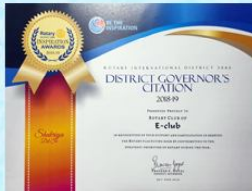
DISTRICT GOVERNOR'S CITATION 2018-19