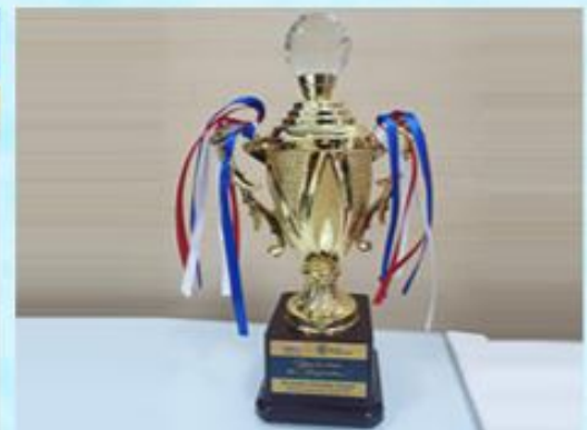
SPECIAL AWARD BY DISTRICT GOVERNOR 2018-19