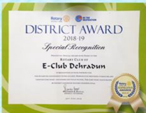
DISTRICT AWARD 2018-19 SPECIAL RECOGNITION