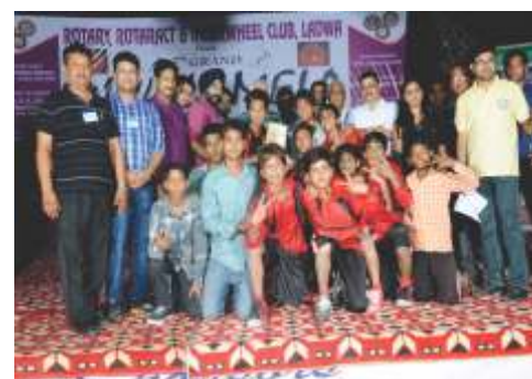
Diwali Mela organised by RC Ladwa