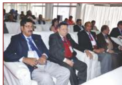
Intercity on vocational services on Panipat