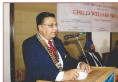
Child Care Project at Mussorie