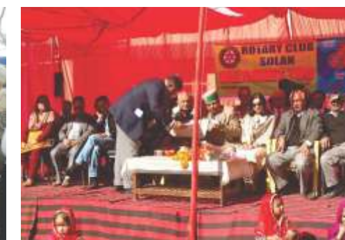
Children's Day organised by RC Solan