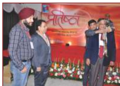
Intercity on Vocational services on Panipat