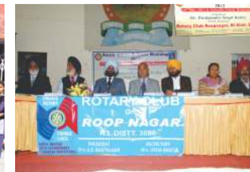
Career Guidance Workshop organised by RC Roopnagar