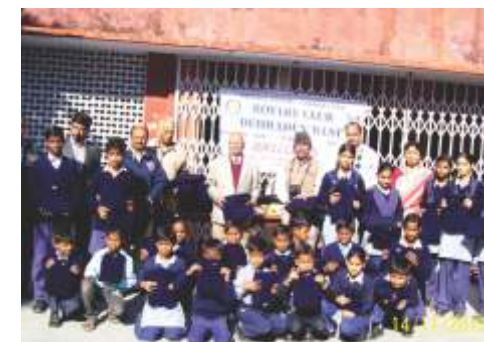
Sweater Distribution by RC Dehradun West.