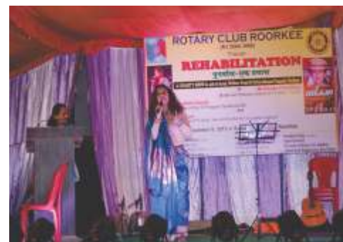
Charity show for Uttarakhand Tragedy Victims & Army Welfare Fund organised by RC Roorkee