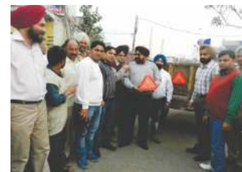
Traffic Awareness Camp organised by RC Nangal Central