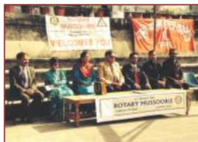
DG Official visit to Mussorie Club