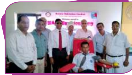
Blood Donation Camp conducted by RC Dehradun Central