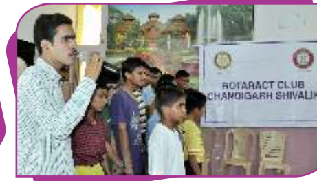
Janmashtmi Celebration at Blind School by RC Chandigarh Shivalik