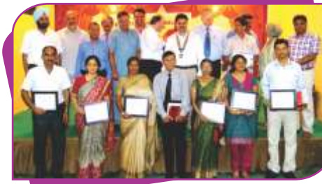
Celebrating Teachers Day by RC Dehradun