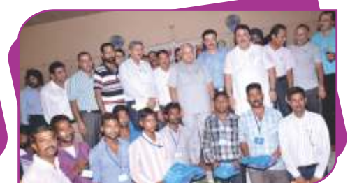
Distribution of Safety Kits to Safai Karamchari by RC Bhakra Nagal