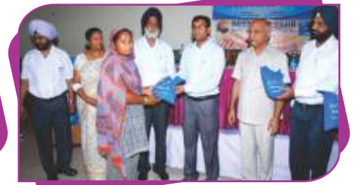
Distribution of Safety Kits to Safai Karamchari's by RC Roopnagar