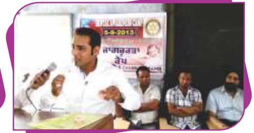
Dental Awareness Camp by Rotary Club Chamkor Sahib