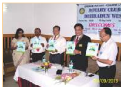
DG Official Visit to Dehradun West