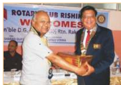
DG Official Visit to Rishikesh