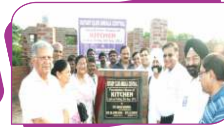
Foundation Stone of Kitchen By RC Ambala Central