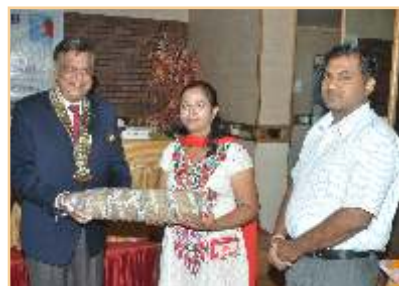
DG Official Visit to Ambala City