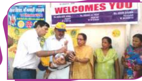
Pulse Polio Mission conducted by RC Ambala Industrial Area