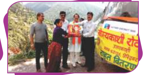
Biomass Gas Stove Distribution by RC Somya, Uttarkashi,