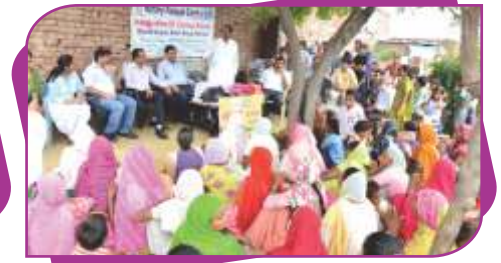
Inaugration of Chetna School for Working Woman By RC Panipat Central in Village Bharat Nagar