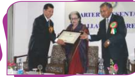
Charter Presentation by RC Theog Hills