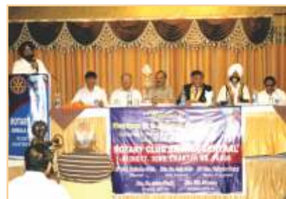
DG Official Visit to Ambala Central