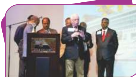
Glimpses in Rotary Institute 2013 Singapore from 22 to 28 Aug