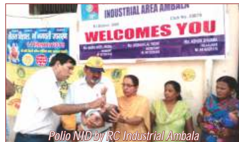
Polio NID by RC Industrial Ambala