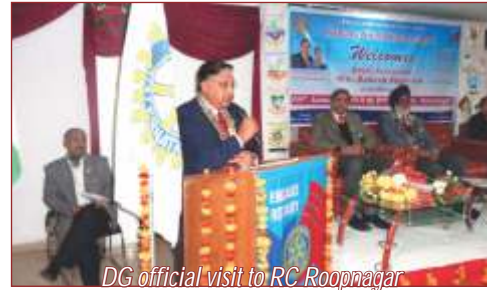
DG official visit to RC Roopnagar