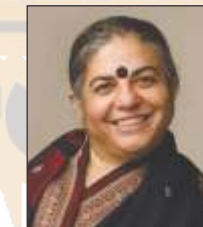
Ms. Vandana Shiva is an Indian environmental activist and anti-globalization