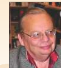
Mr. Ruskin Bond