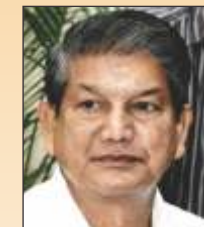
Mr. Harish Rawat Chief Minister of Uttarakhand