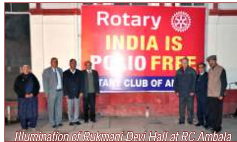
Illumination of Rukmani-Devi Hall at RC Ambala