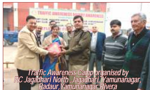
Traffic Awareness Camp organised by RC Jagadhari North, Jagadhari, Yamunanagar, Radaur, Yamunanagar Rivera