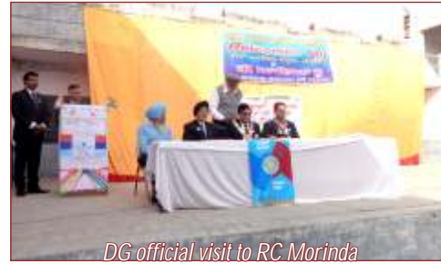
DG official visit to RC Morinda