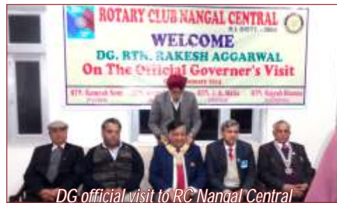
DG official visit to RC Nangal Central