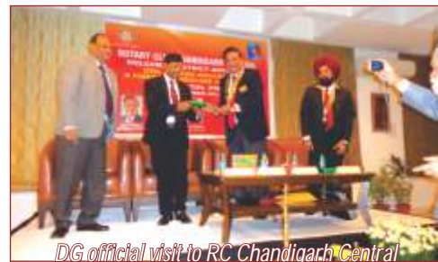
DG official visit to RC Chandigarh Central