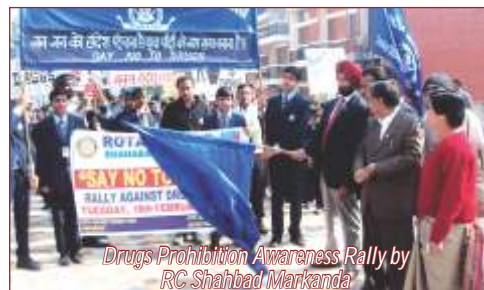
Drugs Prohibition Awareness Rally by RC Shahbad Markanda