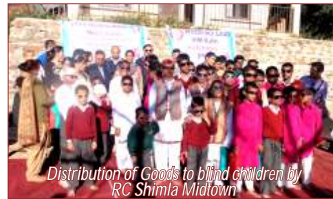
Distribution of Goods to blind children by RC Shimla Midtown