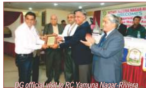
DG official visit to RC Yamuna Nagar-Riviera