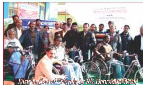
Distribution of Tricycle by RC Dehradun West