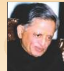
Mr. Sudarshan Aggarwal (Ex Governor Uttarakhand)