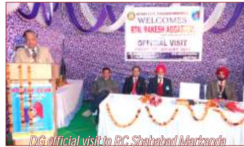
DG official visit to RC Shahabad Markanda