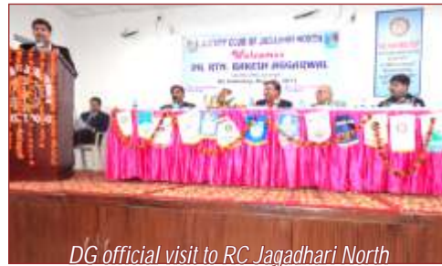
DG official visit to RC Jagadhari North