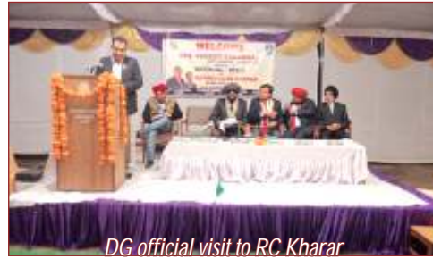
DG official visit to RC Kharar