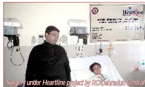
Surgery under Heartline project by RC Dehradun Central