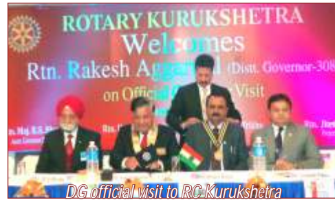
DG official visit to RC Kurukshetra