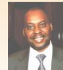
H.E. Ernest RWAMUCYO, High Commissioner of the Republic of Rwanda