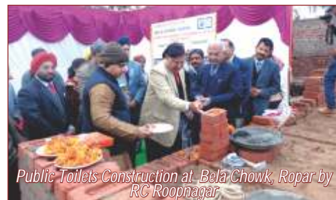
Public Toilets Construction at Bela Chowk, Ropar by RC Roopnagar