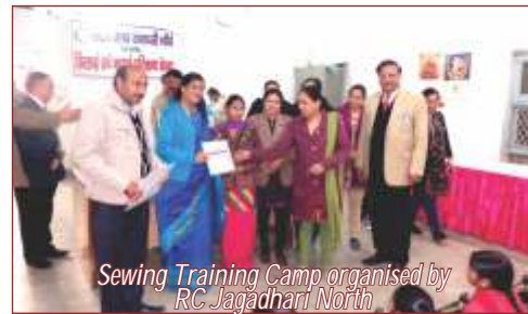
Sewing Training Camp organised by RC Jagadhari North