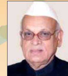
H.E. Dr. Aziz Qureshi, Governor of Uttarakhand