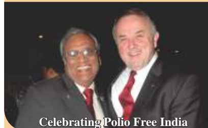
Celebrating Polio Free India