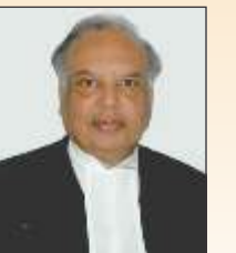
Justice Vijender Jain