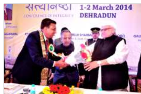
Welcome of Chief Guest H.E Dr Aziz Qureshi