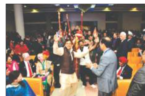
Musical Entertainment on 1st March performance by Clubs