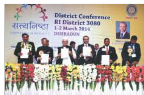
Release of Conference Souvenir