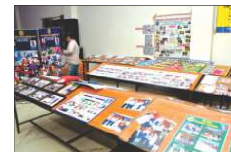
Display of Club Photographs and Details done by Clubs