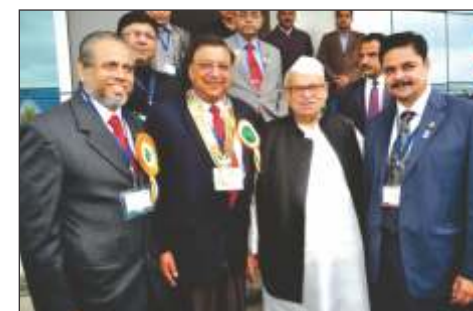
H.E. Dr Aziz Qureshi Governor of Uttarakhand at DISCON 2014