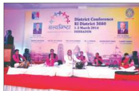
Pre-Conference Qawwali Programme