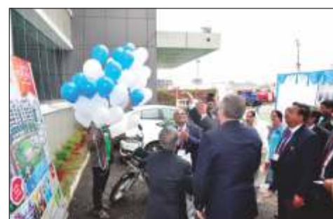
Inauguration of Conference by release of balloons & Pegions