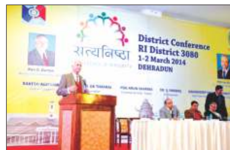
Leadership Seminar 28th Feb 2014