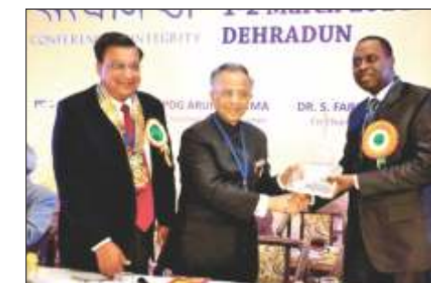
H.E. Ernest RWAMUCYO, High Commissioner of The Republic of Rwanda at DISCON 2014