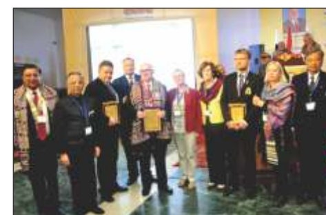
RFE Team form District 1410 Finland at DISCON 2014