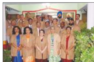
Medical Mission to Neemuch from 4th to 13 March a small place at Madhya Pradesh. A Team from our District consisting of Doctors and volunteers did a great service by, More than 2000 People were benefitted.