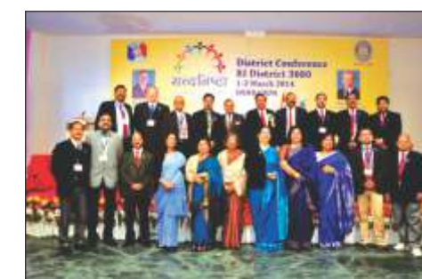
Team Host Club Rotary Dehradun, Did a wonderful Show