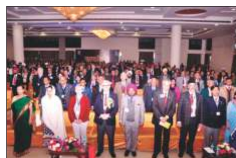
Huge Numbers of Delegates attended DISCON 2014