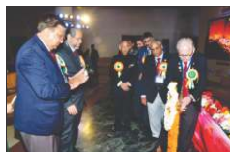
Lighting of Lamp at Inaugural Session