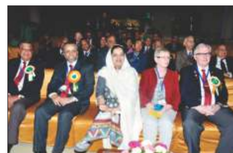
Delegates at Conference Inaugural Session