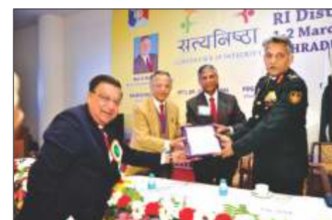
Lt. Gen Anil Chait Being Honored at DISCON 2014