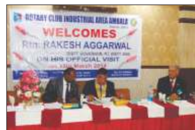
DG Official Visit to RC Industrial Area Ambala