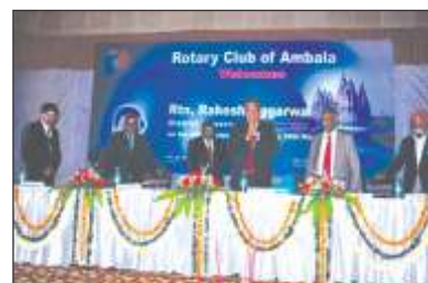
DG Official Visit to RC Ambala