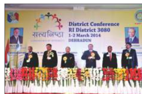
Plenary Session I at DISCON 2-14